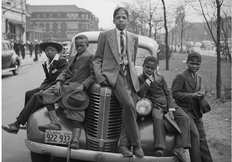
Russell Lee Negro Boys on Easter Morning. Southside, Chicago, Illinois, 1941